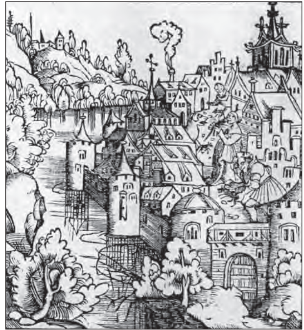
Fig. 4. Nancy (details), Liber Nanceidos, print in Saint-Nicolas, 1518

that date, there is no mention of the large bombard anymore nor of any other bombards except for their destruction and the use of metal from them for other fabrications (a bombard was destroyed in 1478 to make a large serpentine).