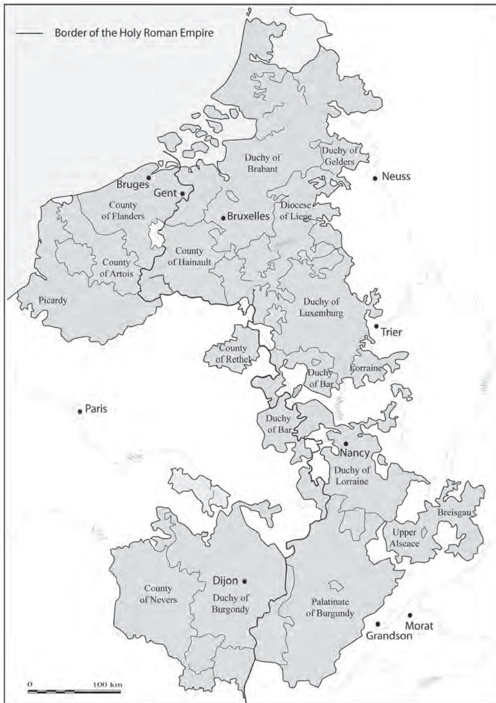
Fig. 1. The House of Valois-Burgundy during the reign of Charles the Bold (1465–1477), adapted from Marti et al. 2008, p. 25

hit the city. This event was a crucial step for the recapture of Lorraine by René II. The incorporation of the Duchy of Bar in 1484 enables to reorganise the tax system and enhance military capabilities (Contamine 2005b, p. 234). Under Charles VIII, the duchy receives financial aids from the monarchy that allow it to be equipped with gunpowder artillery and