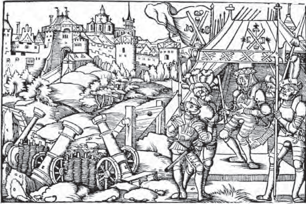
Fig. 6. The second siege of Nancy by Charles the Bold, winter 1477, Idem

construction is provided (including using the foundry worker if necessary).