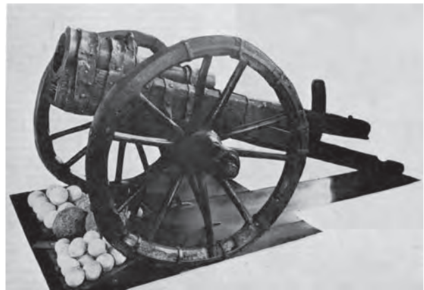
Fig. 7. Artillery of Burgundy storming, battle of Nancy, Deutsches Historisches Museum, Berlin

The construction techniques used are relatively simple: longitudinal strips of iron were welded together with iron hoops driven over them from end to end. The carriage of these guns requires a large number of metal bands to keep the weapons on the frame. This work requires a lot of workers, which is frequently mentioned in these accounts. Once