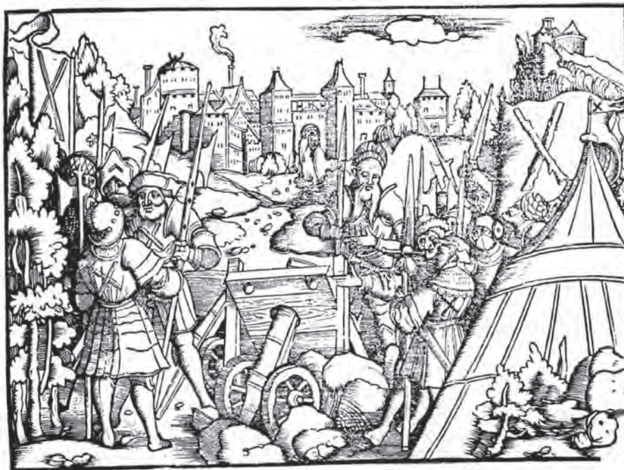
Fig. 5. The first siege of Nancy by Charles the Bold, winter 1475, Idem